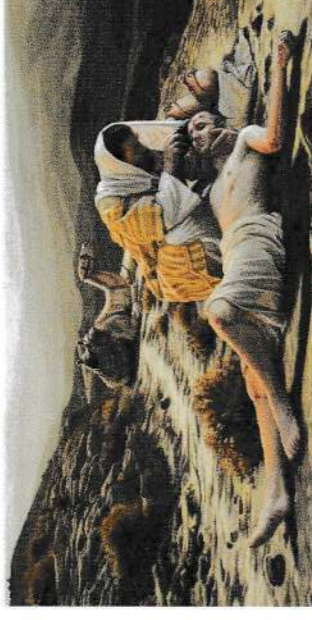
Who is my neighbour? Luke 10: 25-37

Sunday 10 th July 2022 Fifteenth Sunday in Ordinary Time