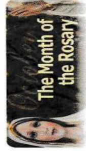
The Month of the Rosary