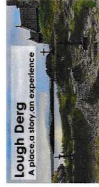
Lough Derg A place, a story, an experience