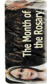
The Month of the Rosary

Baptisms are now again being Celebrated. If you wish to organise a Baptism, Please contact the Baptism Team Coordinator on 07803272403.