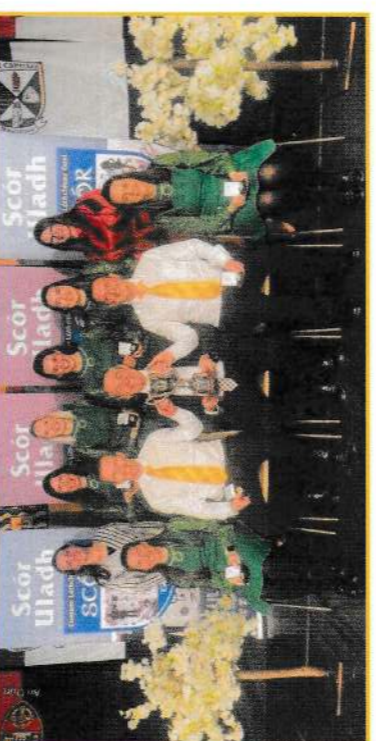
TWENTY-NINE CHAMPIONS AT CLONDUFF

Hospice Church Door Collection will be taken up this weekend Saturday 28 th and Sunday 29 th October. Dignity in Caring. Please give generously.