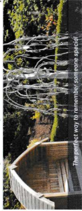
The perfect way to remember someone special

The Memory Tree is located in the Southern Area Hospice Memory Garden and provides a beautiful and meaningful way to remember a loved one whilst also helping the Hospice to continue delivering specialist palliative care to patients and support to their families.